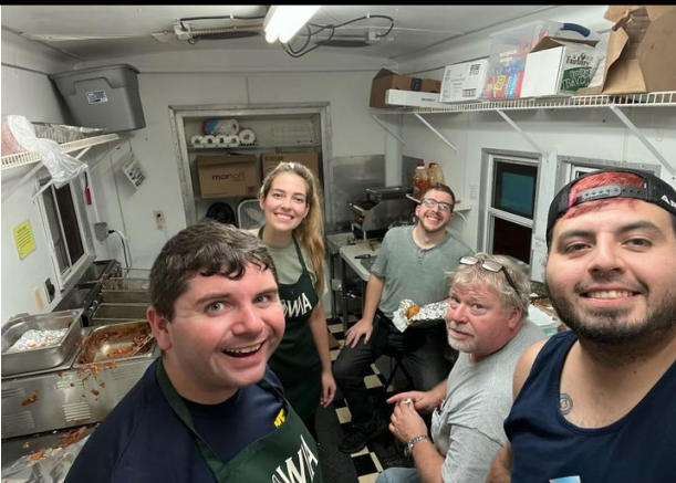
Friday Night Booth Volunteer Crew

For more pictures, check out our Facebook page.